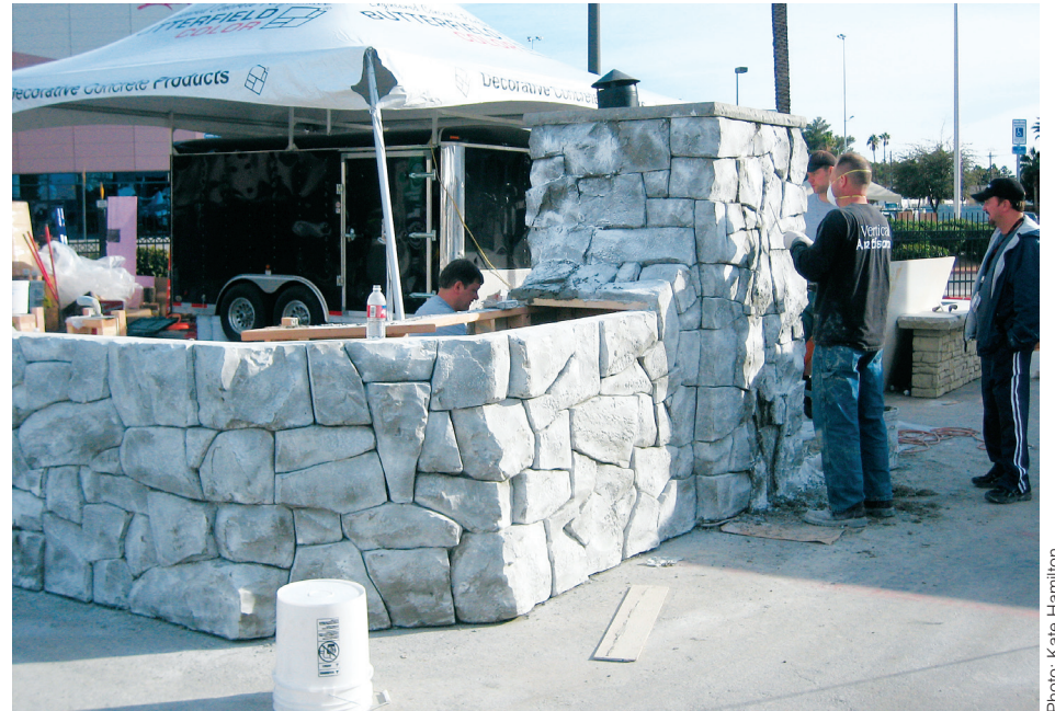
Decorative concrete manufacturers such as Butterfield Color will be on hand near the contractor clinics to offer more tips and techniques to interested attendees.

Glass-fiber reinforced concrete is not just a "spray on" process. Learn about different techniques using glass fibers to