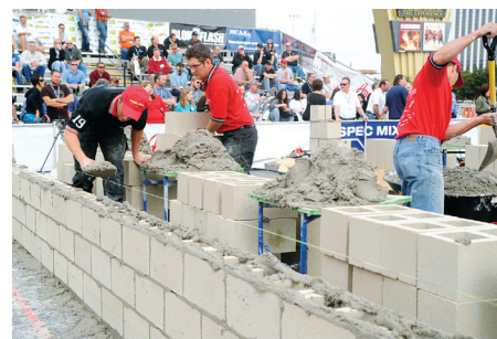
MCAA's FASTEST TROWEL On The Block

Twenty journeyman masons, accompanied by two tenders, will compete against one another in a show of both speed and craftsmanship. Each contestant's goal is to complete as much of an 18-blocklong wall as possible, using 8x8x16-inch CMUs and the provided mortar in a 20-minute heat.