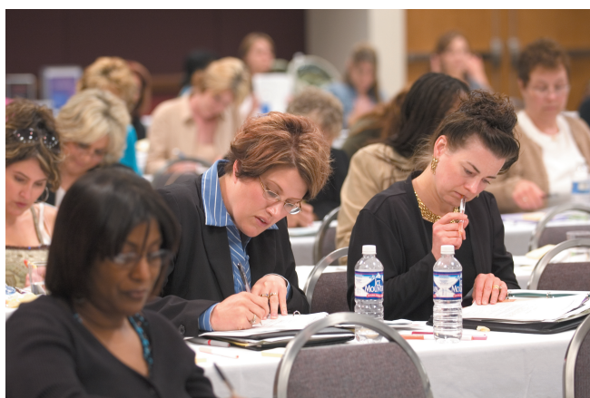
Attendees take diligent notes during the Product-neutral Educational Workshops.