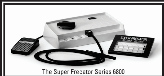
The Super Freicator Series 6800

Now you can meet the high demand from your clients for the removal of skin growths with innovative technology used with great success to treat common, red and flat moles, age spots, warts, skin tags, ruby points, subcutaneous fatty deposits, and unsightly calcium bumps.