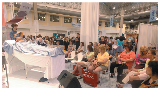
Attendees took advantage of demonstrations on the show floor to learn directly from the experts.