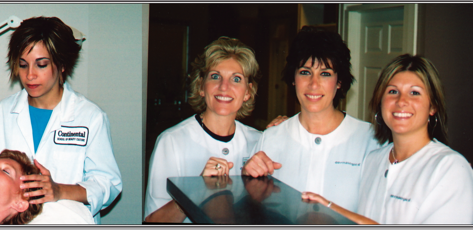
clients by a licensed instructor.