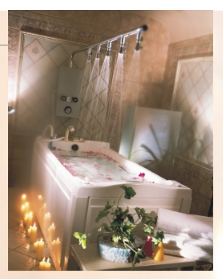
The luxurious bath is surrounded by candles and scented with the client's choice of 25 different aromatherapy scents.

With 77 different treatment options to choose from, ranging from massages, body wraps and scrubs, to baths and kurs, the