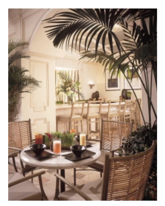
After a full day of treatment, clients can relax with fresh juice or lunch.

Choosing to emphasize quality service rather than an aggressive marketing approach is very important to Holder. "You can