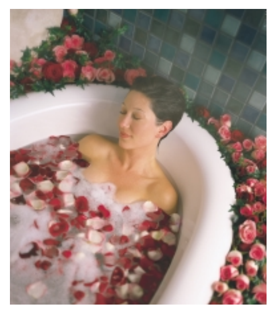
The Lady Primrose English Garden Ritual soothes and pampers with a sensual bath rich in rose petals.