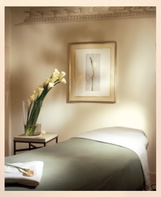
At The Spa at The Crescent, comfort and service are of utmost importance.

Lagniappes, unexpected gifts or benefits, are featured throughout the treatment menu.